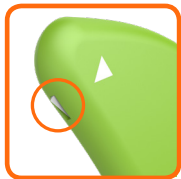
Slice® micro-ceramic blade